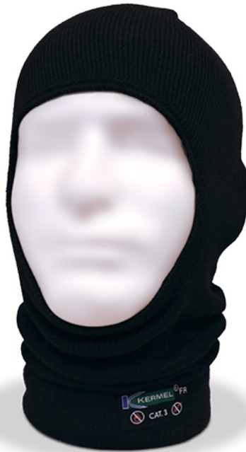
STYLE J58 KERMEL® KNIT RIB BALACLAVA