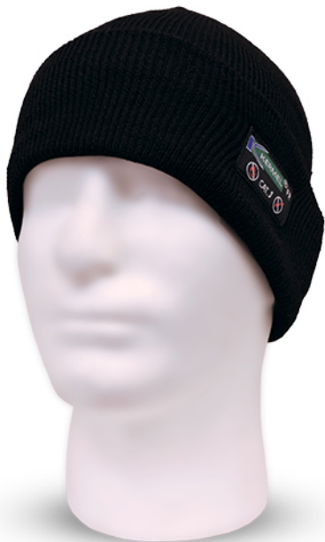
STYLE J57 KERMEL® KNIT RIB FOLDED TOQUE