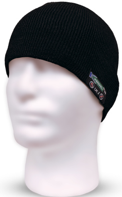
STYLE J58 KERMEL® KNIT RIB BEANIE